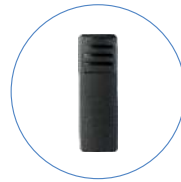
Belt Clip BC39