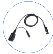
PTT&MIC Controller ACN-02P