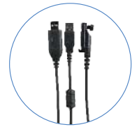
Programming Cable PC156