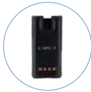
2,400 mAh Li-Poly Battery BP2402