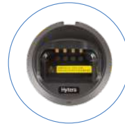
Charger (1A) CH10L29