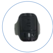
Wireless PTT POA121