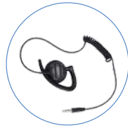
Receive-only Swivel Earset EH-02