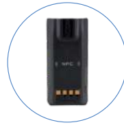
4,000 mAh Li-poly Battery BP4005