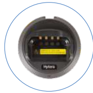
Charger (2A) CH20L13