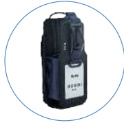
Nylon Carry Case NCN029