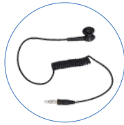
Receive-only Earbud ES-01