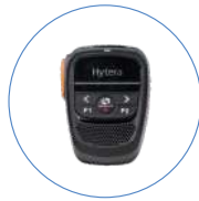
Wireless Remote Speaker Microphone SM27W2