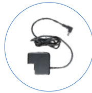
Power Adapter (2A)