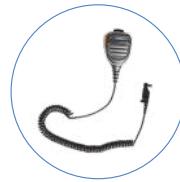
Water-proof Remote Speaker Microphone SM26N1-P